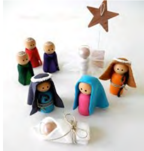
THE MANGER PROJECT

Join us for our Annual Family Advent Workshop on Sunday, November 23rd at 10:30am-11:30am!