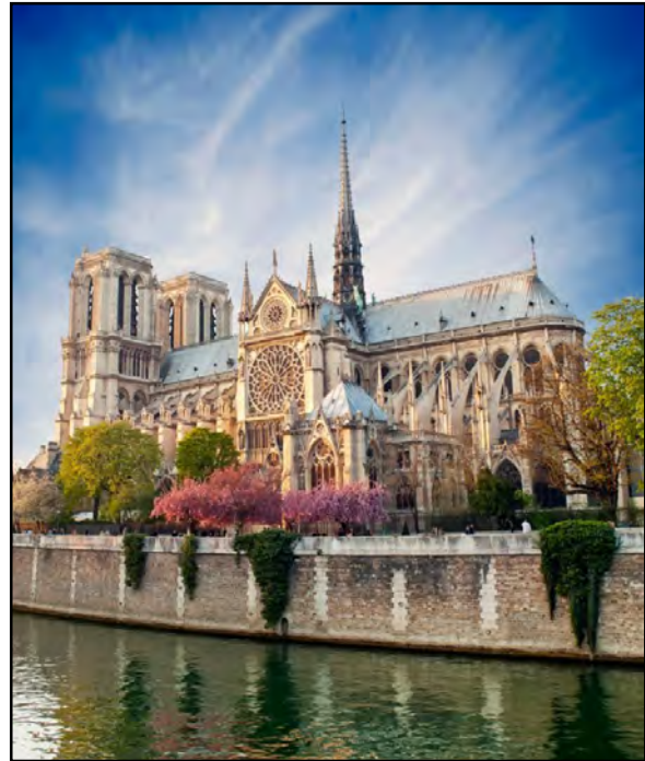
Notre Dame Cathedral, Paris